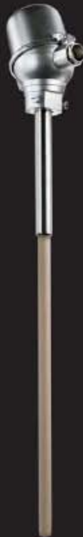
Thermo couple: TC-AC/ACC For measuring high temperatures in ovens and channels for fuel gases and air up to 1700°C.