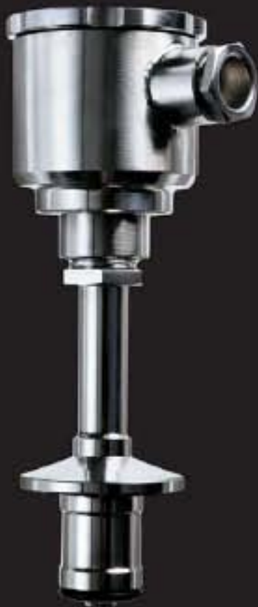
Resistance thermometer: RT-B-C-APV For measuring in containers, tanks and pipe systems where the sensor can be replaced without emptying the system preventing "dead volumes".

“... guaranteeing you the best product and service”