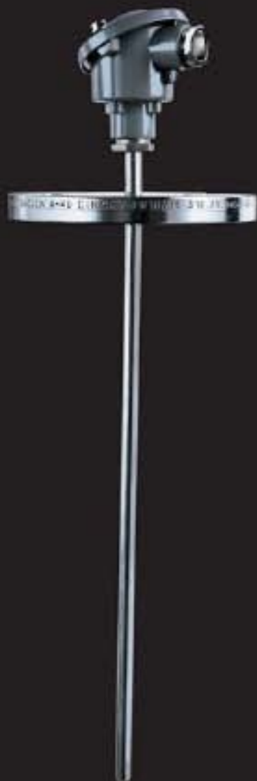
Resistance thermometer: RT-8 For measuring temperatures in closed pipelines and containers with gaseous or liquid media. With interchangeable insert.