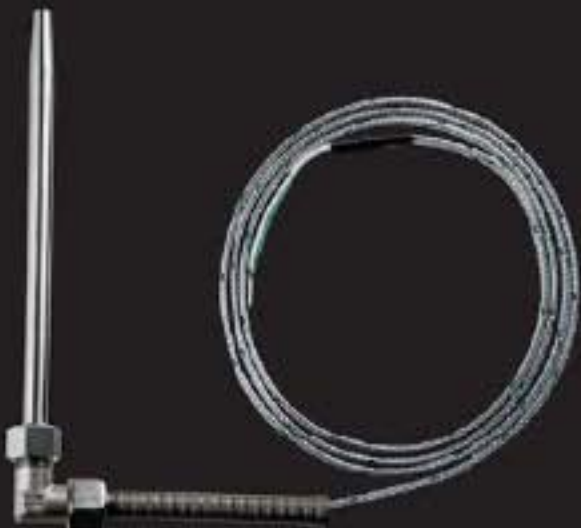
Thermo couple: TC-TEG1-A For measuring exhaust gas in stationary or maritime diesel engines and turbines.

“... standard and tailor-made solutions”