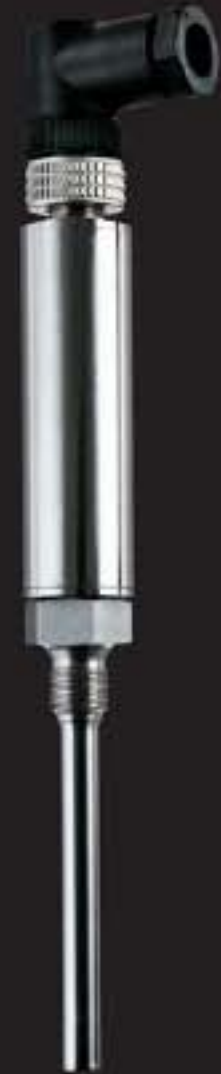
Resistance thermometer: RT-B-PC9-TT For measuring temperatures of liquid and gaseous media. For applications that require the sensor to be quickly dismantled electrically. Built-in transmitter.