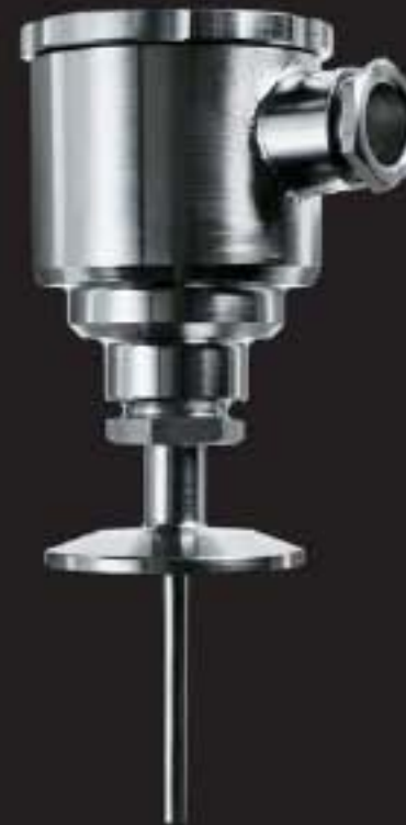
Resistance thermometer: RT-B-C For measuring temperatures in the food industry, the pharmaceutical, cosmetic and chemical/technical industries.