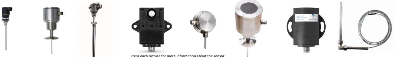
Press each picture for more information about the sensor

Click here to get to our knowledge center on our website.